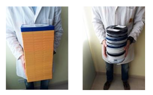
Fig. 5 Case stack vs. bare stack

The cases give one more benefit. The fact that the cases are stackable, allows secure handling of the components outside the machine. Trying to carry a stack of 50 bare plastic reels is difficult and risky. With the cases, the parts can be carried securely, and protected from ESD at all times.