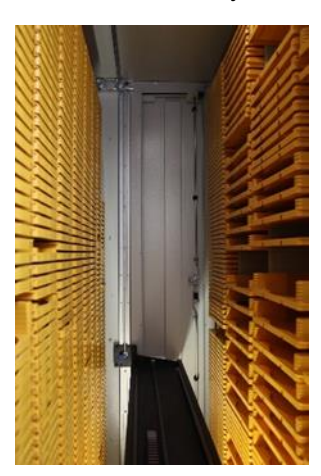
Fig. 7 View of several different height 15-inch cases inside a 3600

With UltraFlex none of this is necessary. Using the adjustable cases previously described in the Case Based System section, cases can be adjusted to meet the new mix. The UltraFlex Storage Unit will accommodate whatever size mix of cases that are fed into it. The space in the machine that is holding a 15-inch 88mm thick case today, can hold three 15-inch 24mm cases tomorrow, and two 15-inch 44mm cases the next day. UltraFlex means that over time, the same unit will adjust to the customer's component mix without the need for modification.