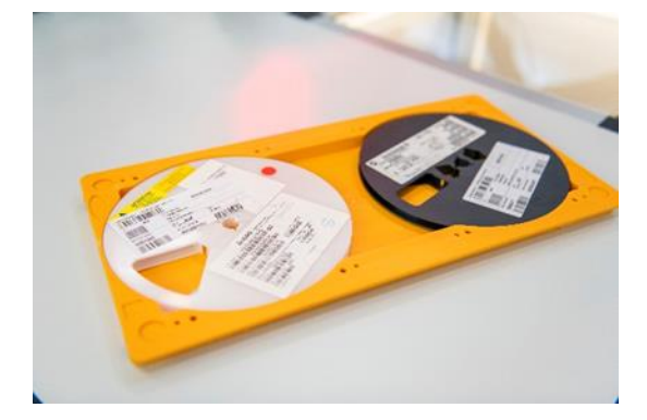
Fig. 2 Reel in a case

The early SMT storage systems held a few hundred parts at most. Today, units holding up to 4,000 reels are very popular. Let's examine the types of systems in the marketplace today.