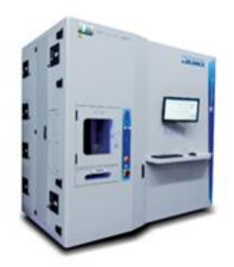
Fig. 1 ISM 3600

huge amount of costly rework, the Automated Component Storage system can pay for itself with this feature alone.