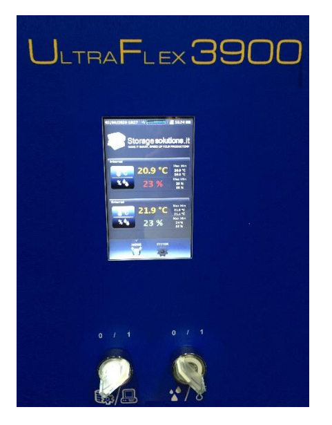
Fig. 6 Humidity display from 3600

While it is out of the Storage System, warnings will be sent as the component approaches expiration, and can be escalated as the expiration time approaches. If the part is baked to restore its eligibility, a supervisor can enter their code and certify the restored eligibility. When an audit occurs, one has only to enter the component part number and unique id, and the system can print out the life history of that component from receipt until all were used. No clipboards or manual entries are needed. The internal tracking system for MSD is also able to share data with any exterior software system, such as MES, to update the status of the MSD components.