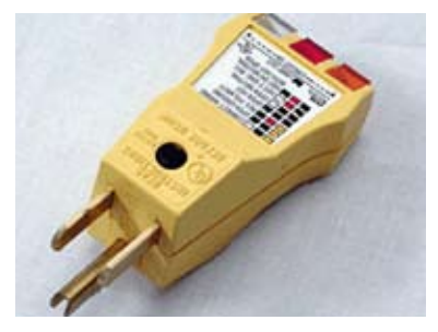
Any electrical outlet can be tested using a ground plug adaptor.