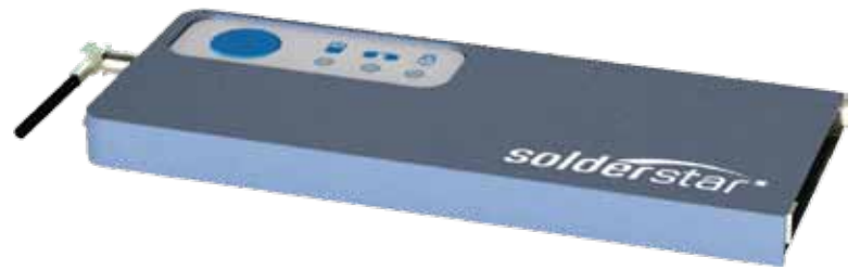
Miniature Profiling Datalogger