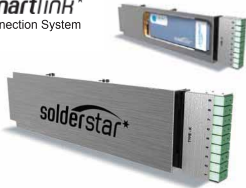
Smartlink Thermal Barrier Concept (9 Channel Version Pictured)

Featuring SolderStar smartlink ★ connection System