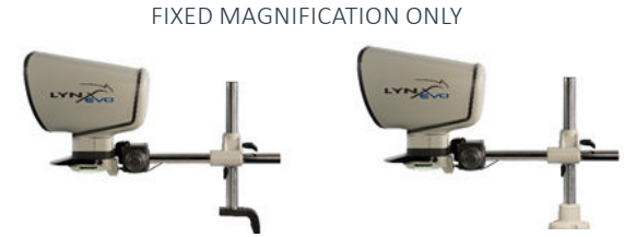
BOOM STAND WITH DESK CLAMP OR DESK BOLT